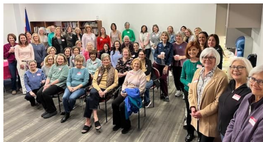
Walking with Purpose hosts a bible study for Catholic women.