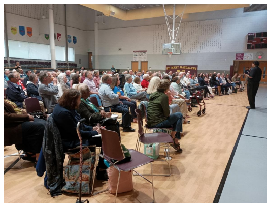
Last Saturday, 215 participants from 18 parishes came together for the Life in the Spirit seminar.