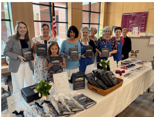
The Columbiettes sold their Taste and See Cookbook, along with rosaries, at the Masses last weekend.