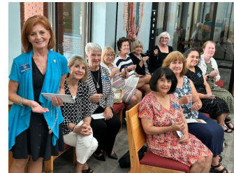
The Columbiettes gathered to pray the rosary in the Chapel on June 23rd.