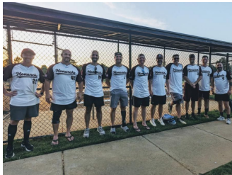
This season marked the first two playoff wins in StMM softball history, achieved by our StMM-White and STMM-Maroon teams.