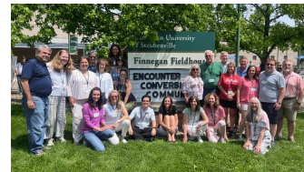
Last weekend, 23 StMM parishioners joined 850 people at the Power and Purpose Conference at Franciscan University.