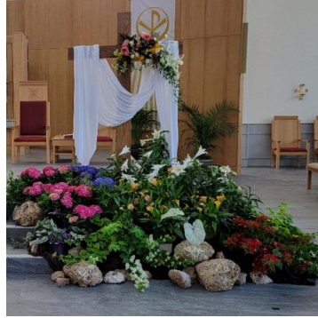
The Church was beautifully decorated inside for Easter.