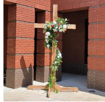
Crosses were adorned with flowers outside the Church.