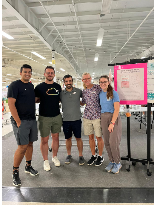
The Frassati Young Adult group helped gather clothing for CPO on Sunday, September 24