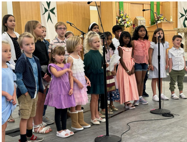
Children's Choir at last weekend's Masses