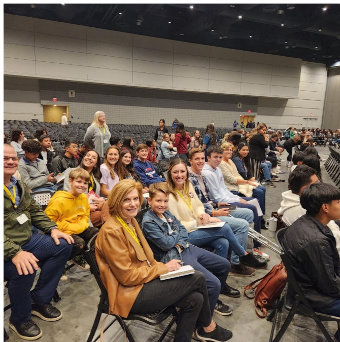
Our Youth Crew at the Eucharistic Congress Keynote Speech