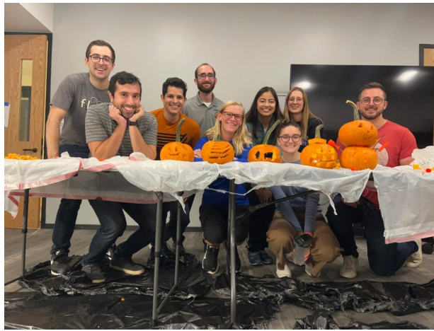
The Frassati Young Adult group celebrated fall with a pumpkin carving contest. To learn more about Frassati, email us at frassati@stmm.net