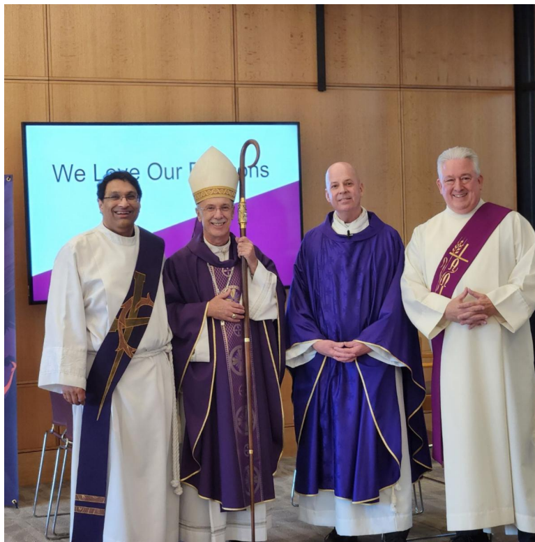
We Love Our Deacons!