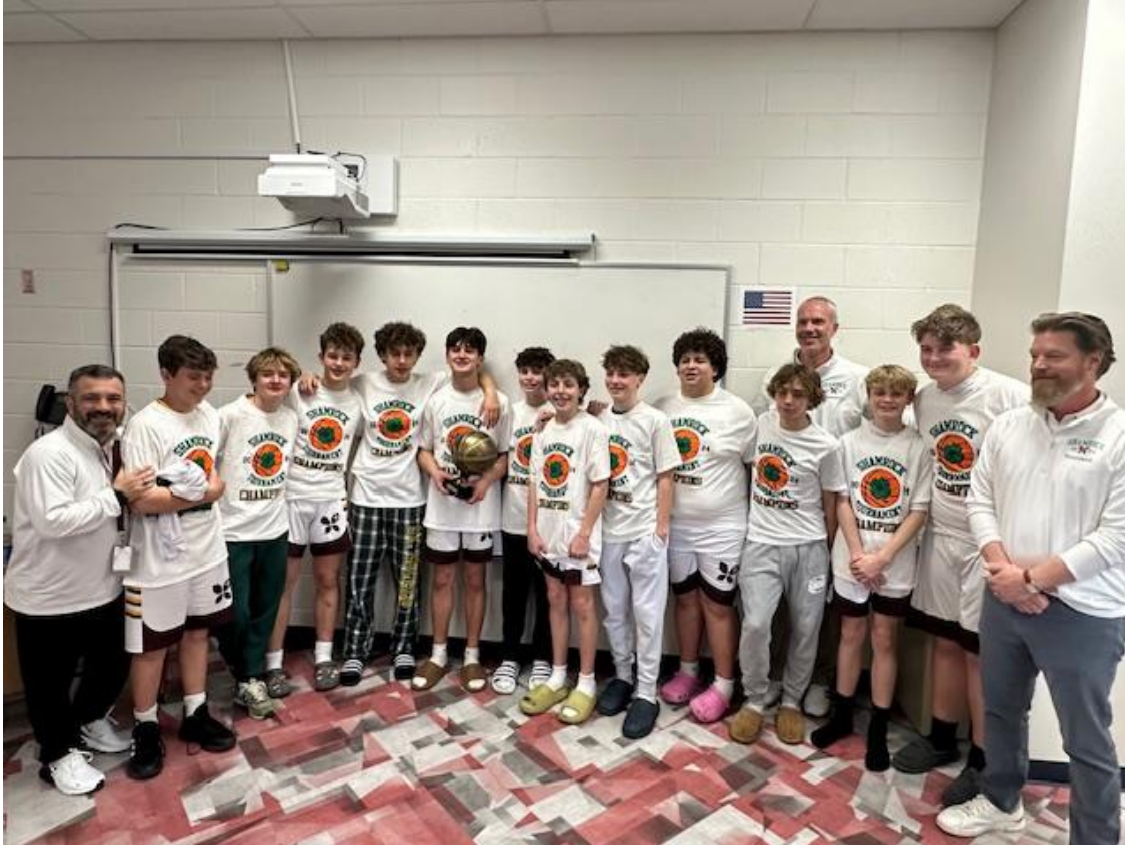
Congratulations to the StMM Boys' Varsity Basketball Team for winning the Shamrock Tournament