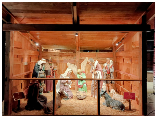
The Knights of Columbus setup the nativity on the piazza.