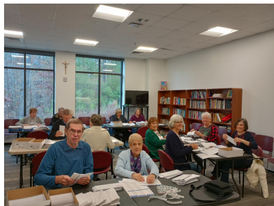
Thank you to the CSO for helping with the Christmas mailing