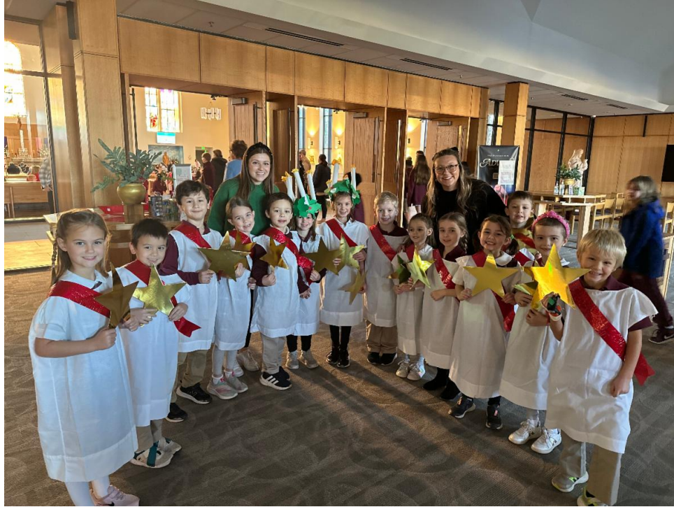
The School Kindergarten Classes celebrated the Feast of St. Lucy