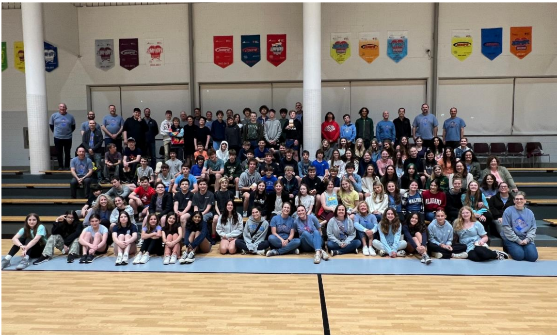
Last Edge Night of 2023-2024 School Year