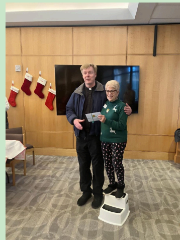
The Catholic Senior Organization had a wonderful time laughing, singing, and celebrating together at their Christmas party on Monday, December 15.