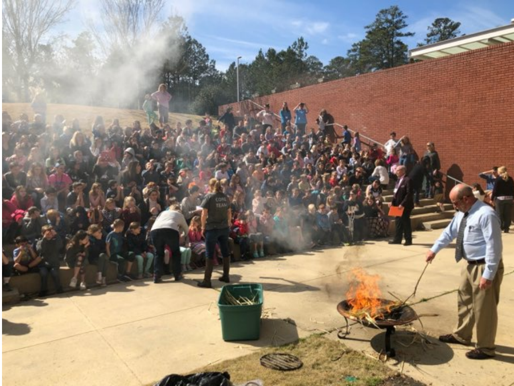
PREP and ROCK children had a lesson on burning of ashes for Ash Wednesday.