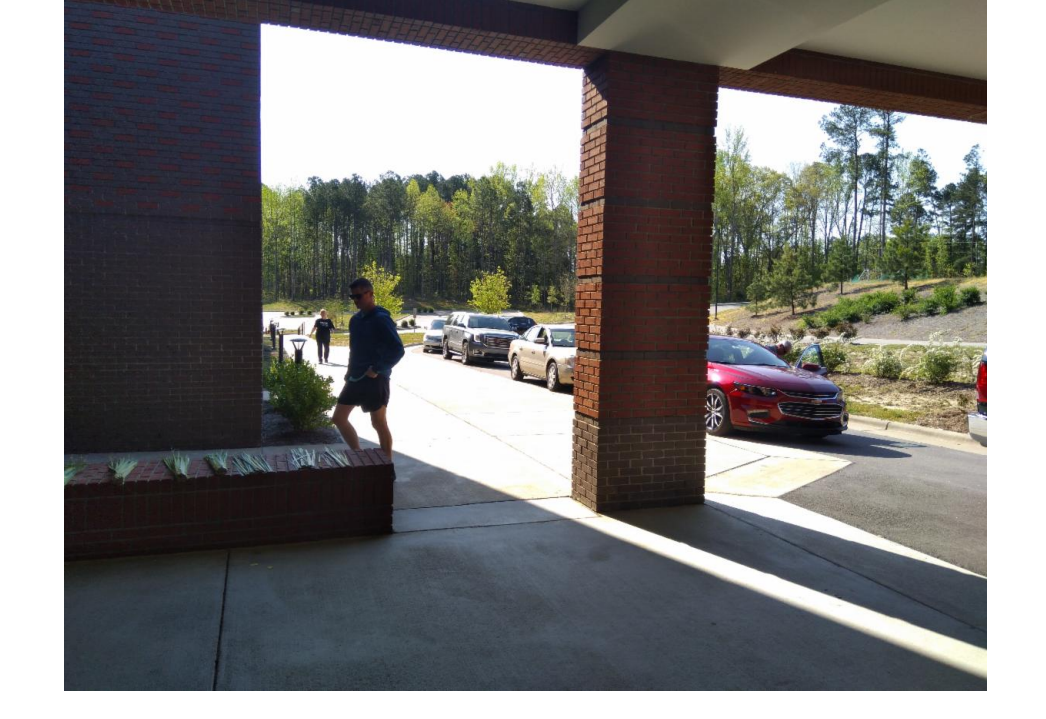
2020 Palm Sunday procession of cars