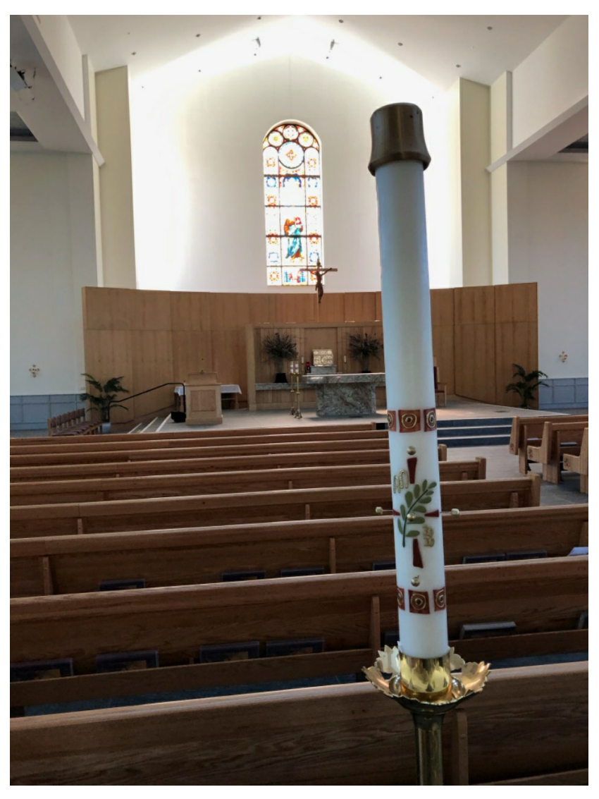
2020 Easter candle

Thank you to Mailbox Medic for installing our own first ever box. It is at the entrance of our school classroom building.