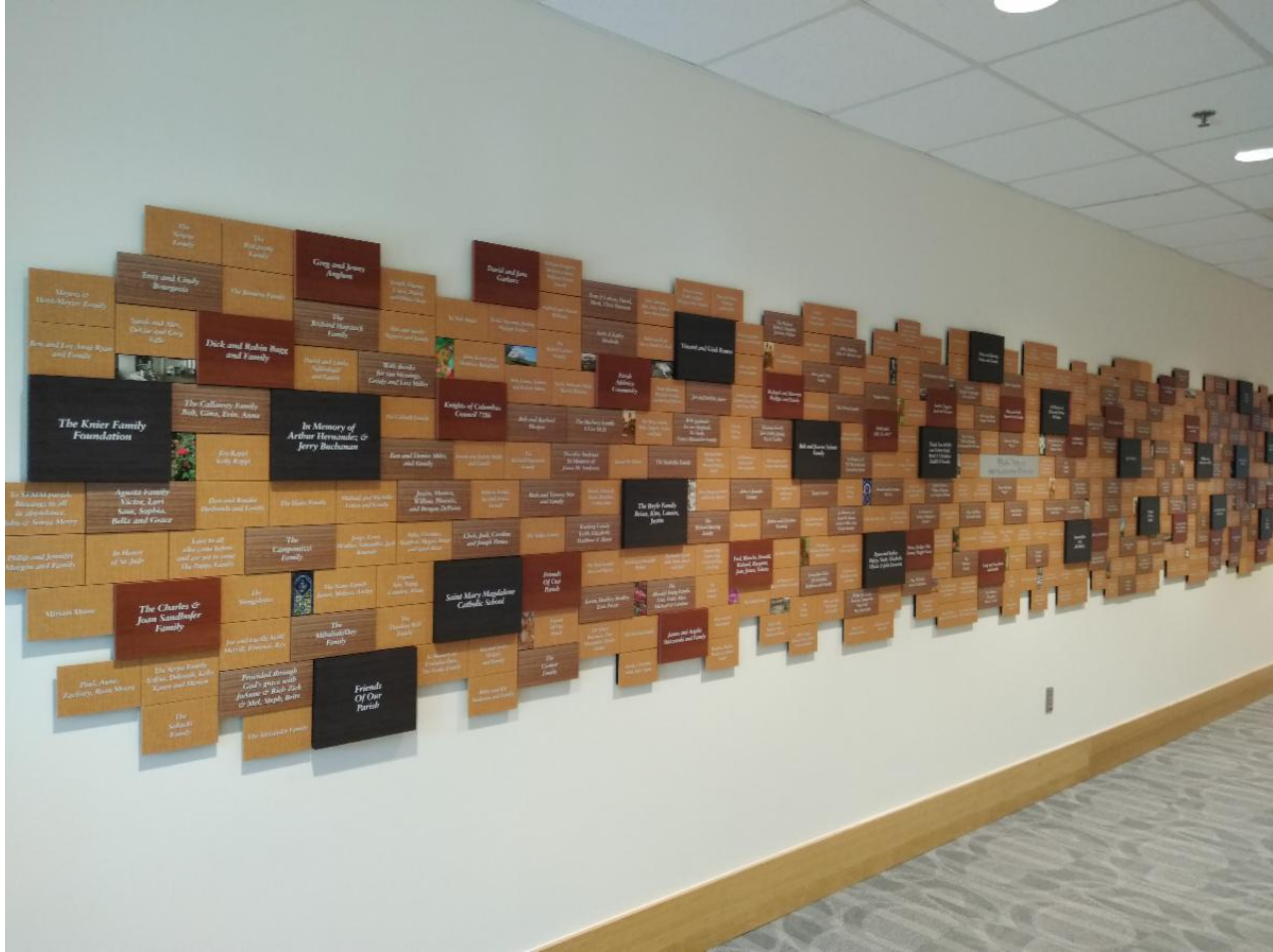
Donor Wall installed this week