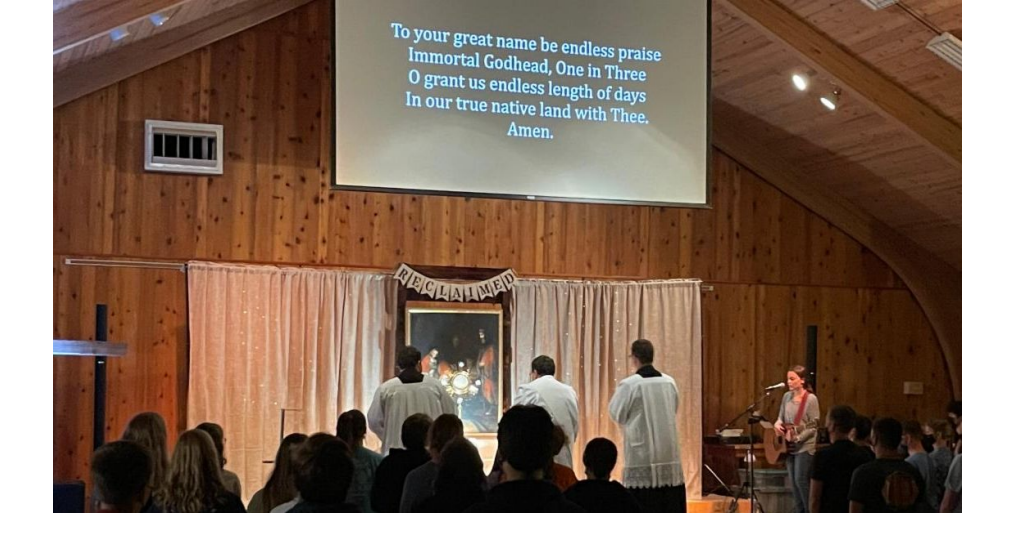
Eucharistic Adoration at the High School Retreat