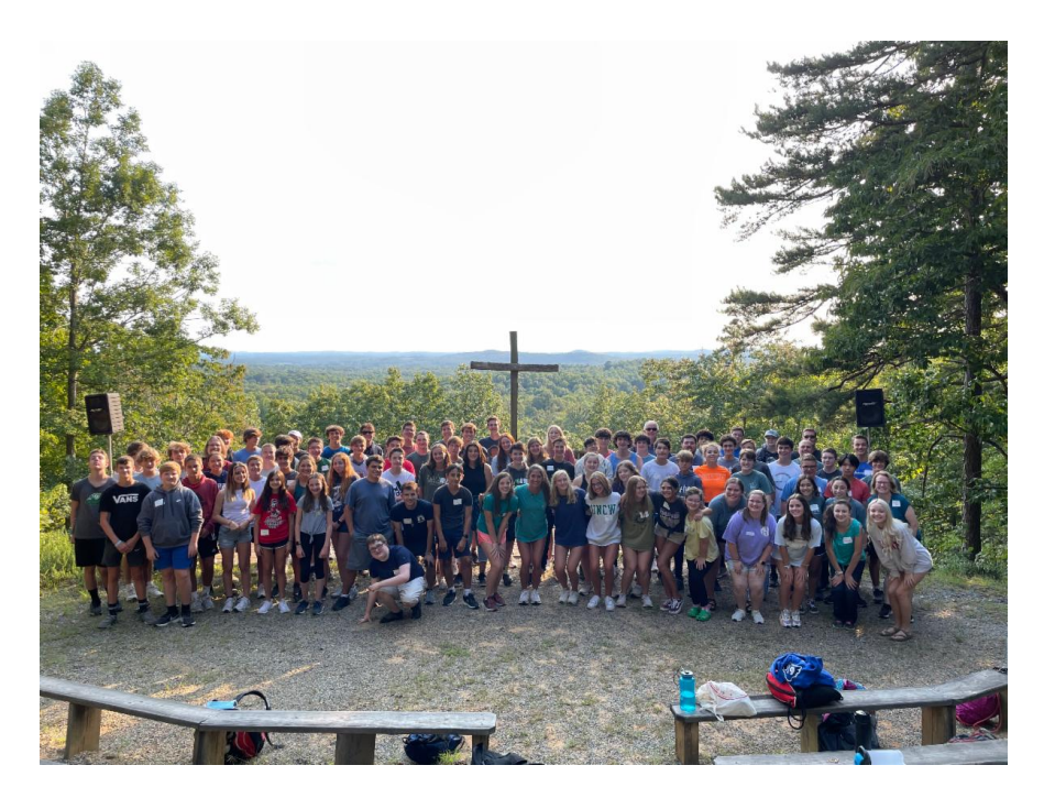
High School Retreat at Camp Mundo Vista