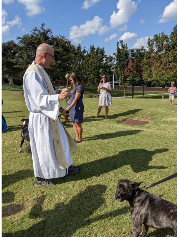
Blessing of the Animals in honor of St. Francis of Assisi