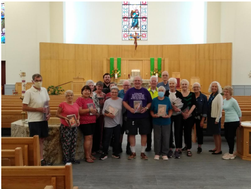
Thank you to the Catholic Senior Organization for putting the new hymnals in the pews this week.