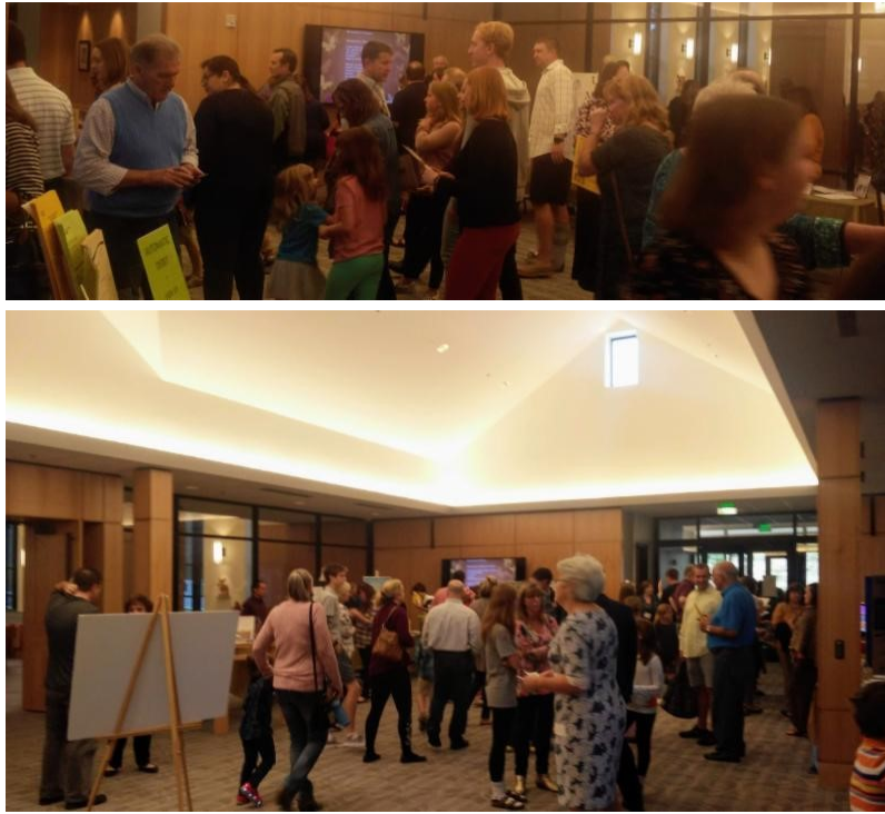
Ministry Fair last weekend