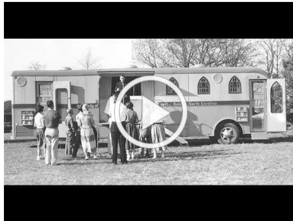
On a Mission: World Mission Sunday

Parishes in the Diocese of Raleigh will welcome global missionaries on Sunday, Oct. 21, for World Mission Sunday. But it wasn't long ago that North Carolina was considered mission territory. Take a step back in time with footage from the 1950s documentary, " In the Footsteps of the Tar Heel Apostle ."