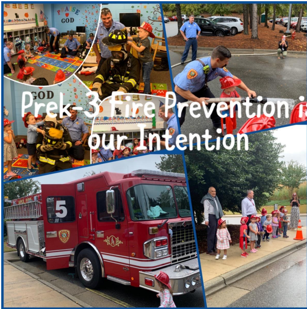
Prek-3's had a visit from the Apex Fire Department this week.