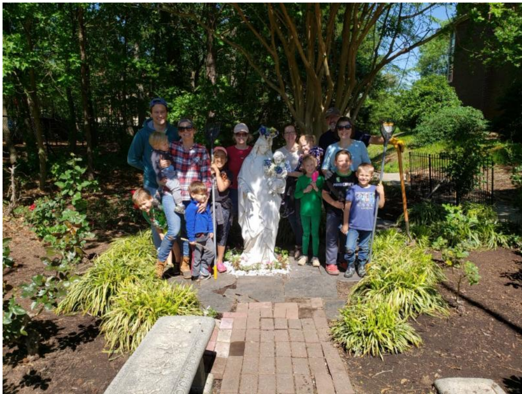
Thank you to the parishioners who cleaned up the rose garden