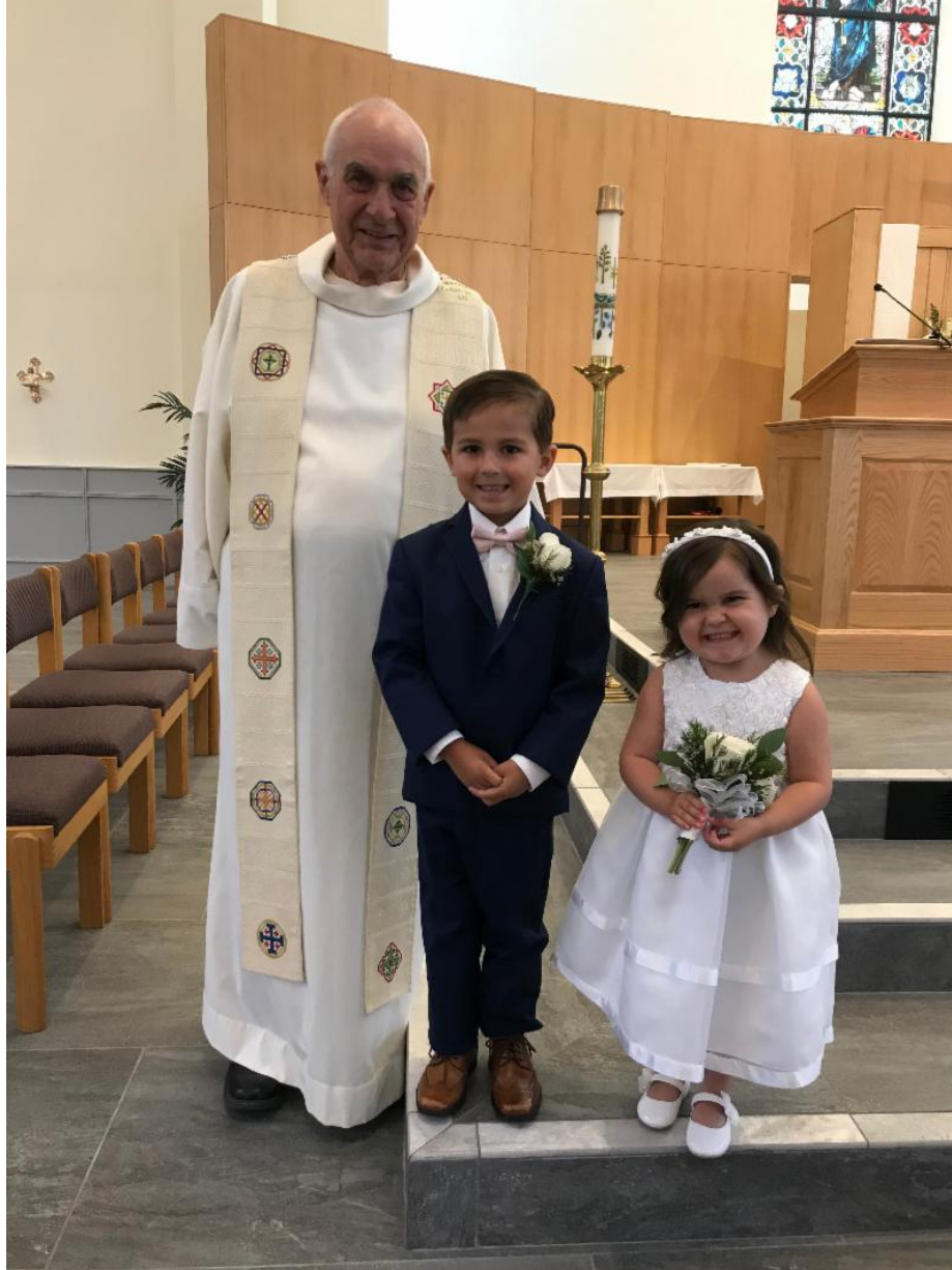
Helpers for the wedding