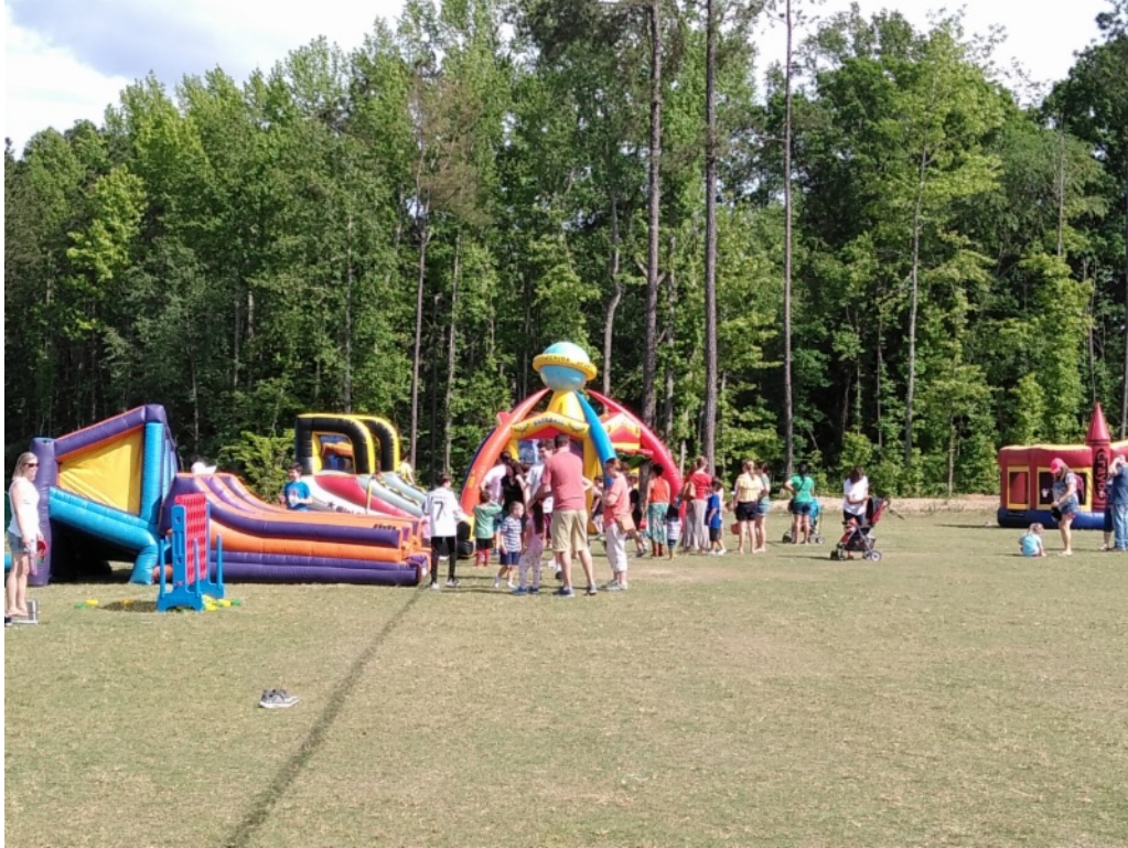
StMM Spring Festival