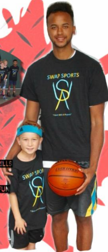
LAST YEAR'S SPECIAL NBA GUEST KYLE ANDERSON (MEMPHIS GRIZZLIES)

FREE BASKETBALL SHOE GIVEAWAYS AND OTHER FUN PRIZES ALONG WITH SPECIAL GUEST VISITS FROM PROFESSIONAL BASKETBALL PLAYERS !!