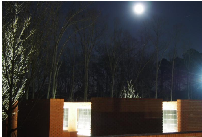
Our Columbarium at Night!