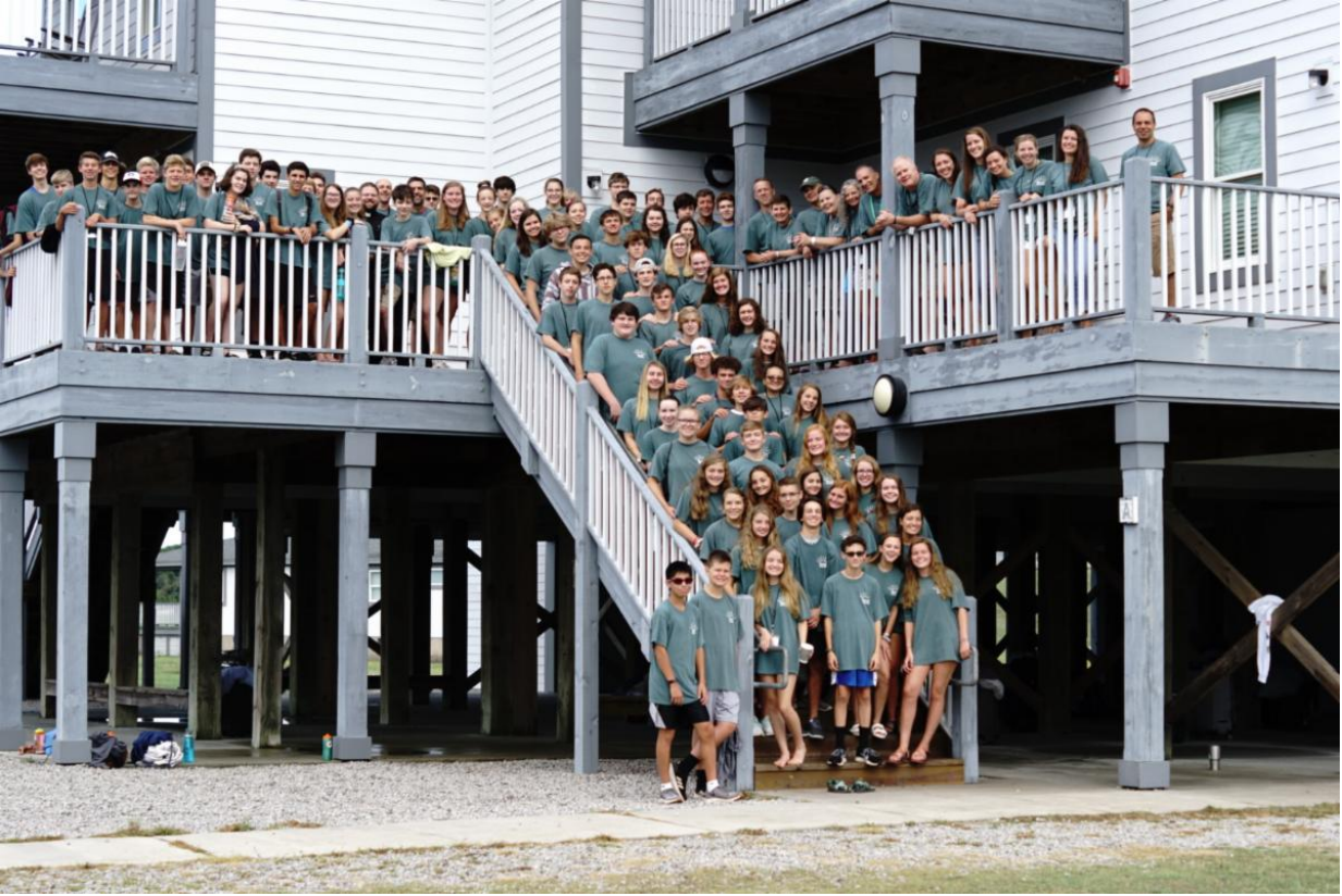
High School Beach Retreat at Fort Caswell