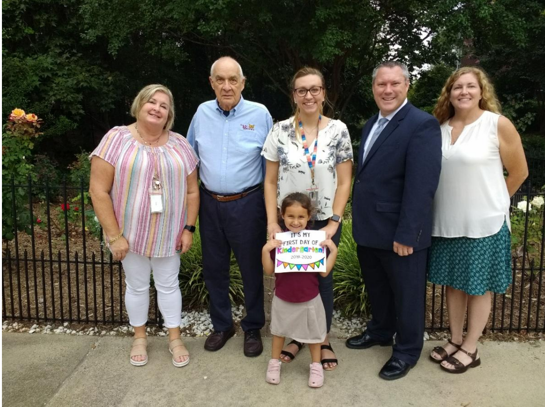
Start of the school year