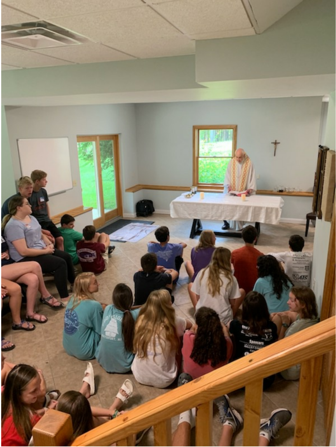
Crew Retreat this week