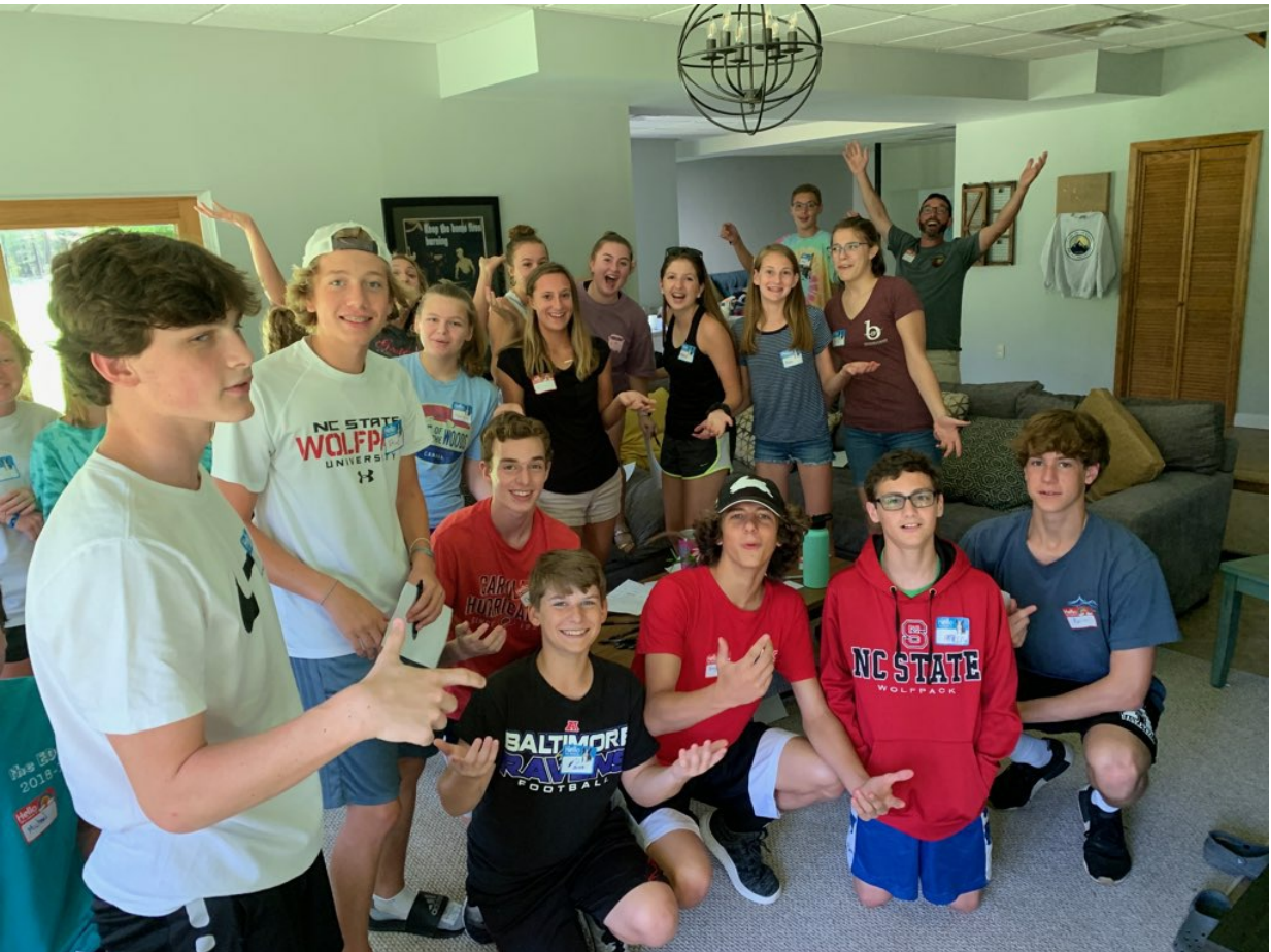
JCrew retreat this week