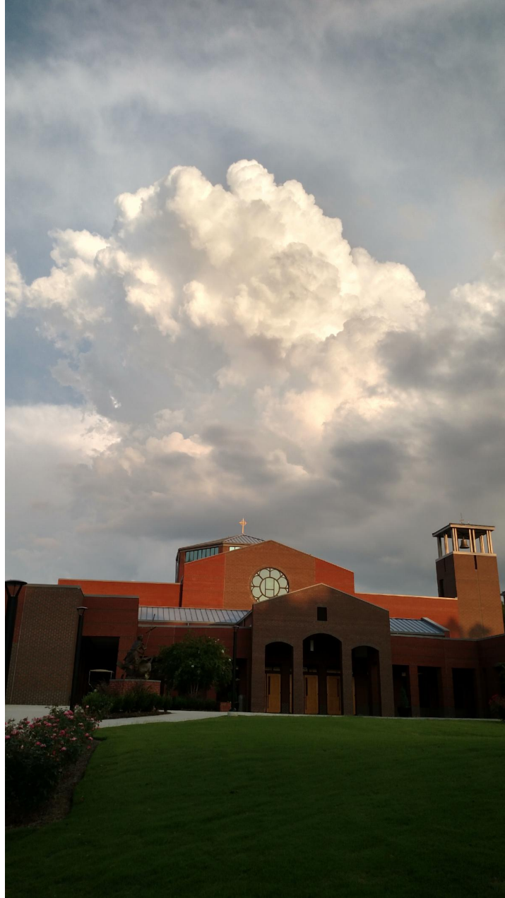
Our Church during Mass on the Assumption