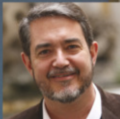
Dr. Scott Hahn