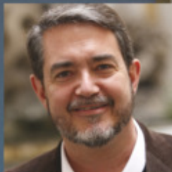
Dr. Scott Hahn