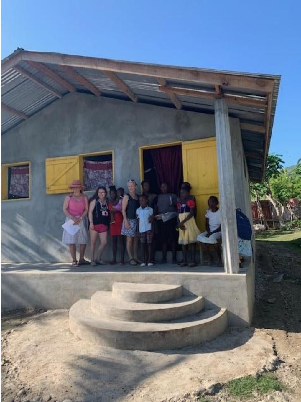
House in Haiti