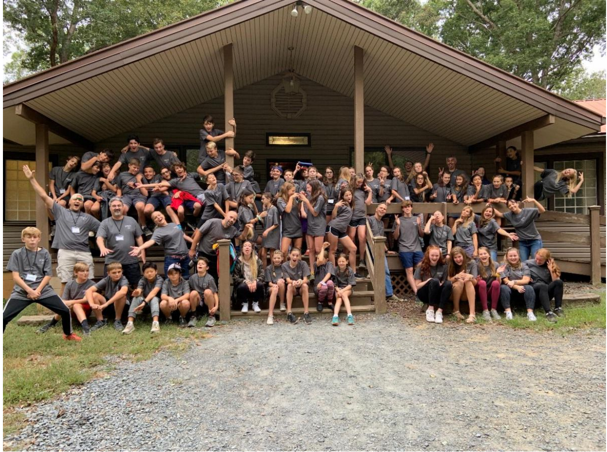
EDGE Retreat at Camp Caraway