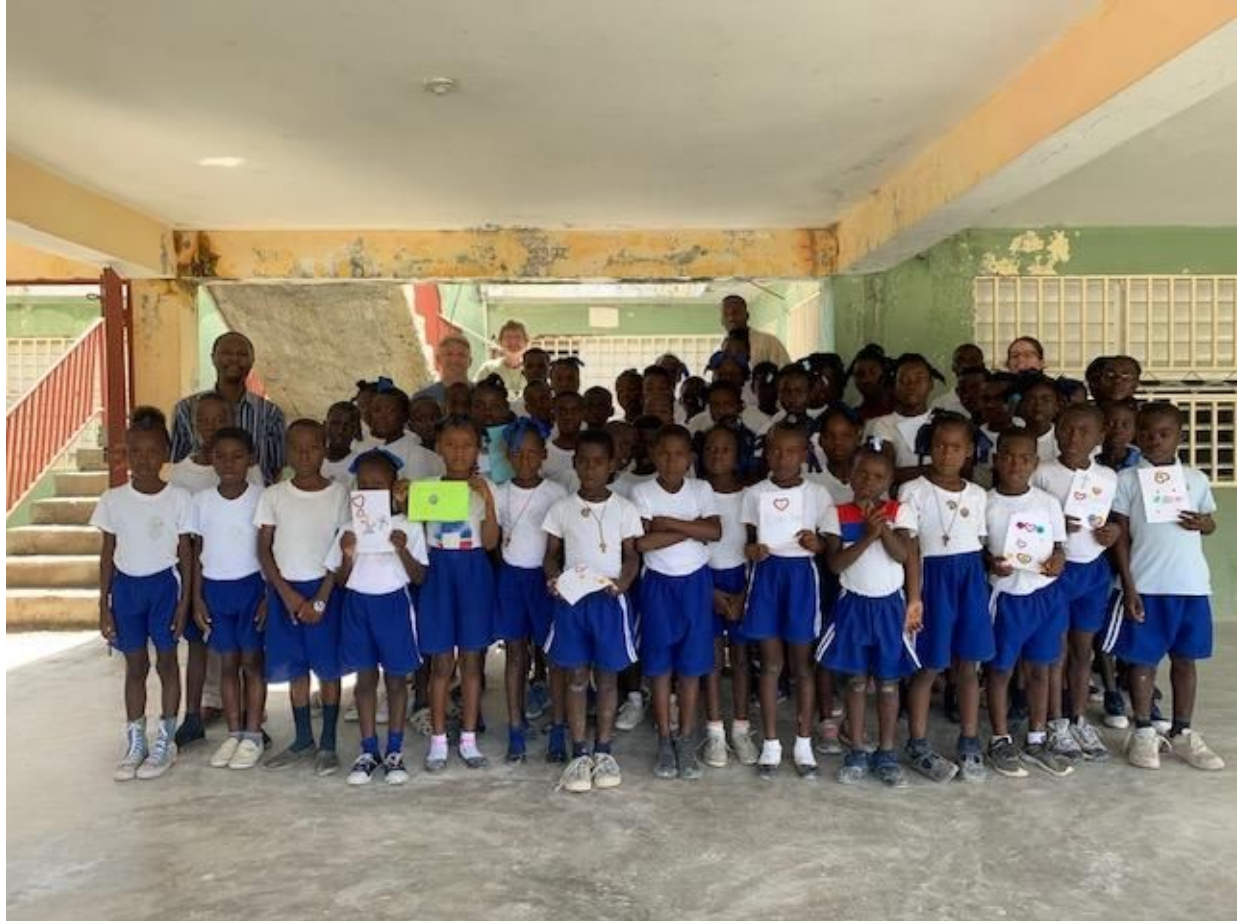
School in Haiti