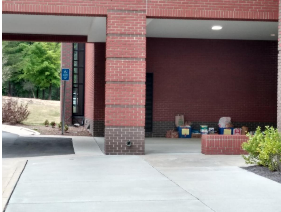
Collection Bins are located by the covered driveway at the Church