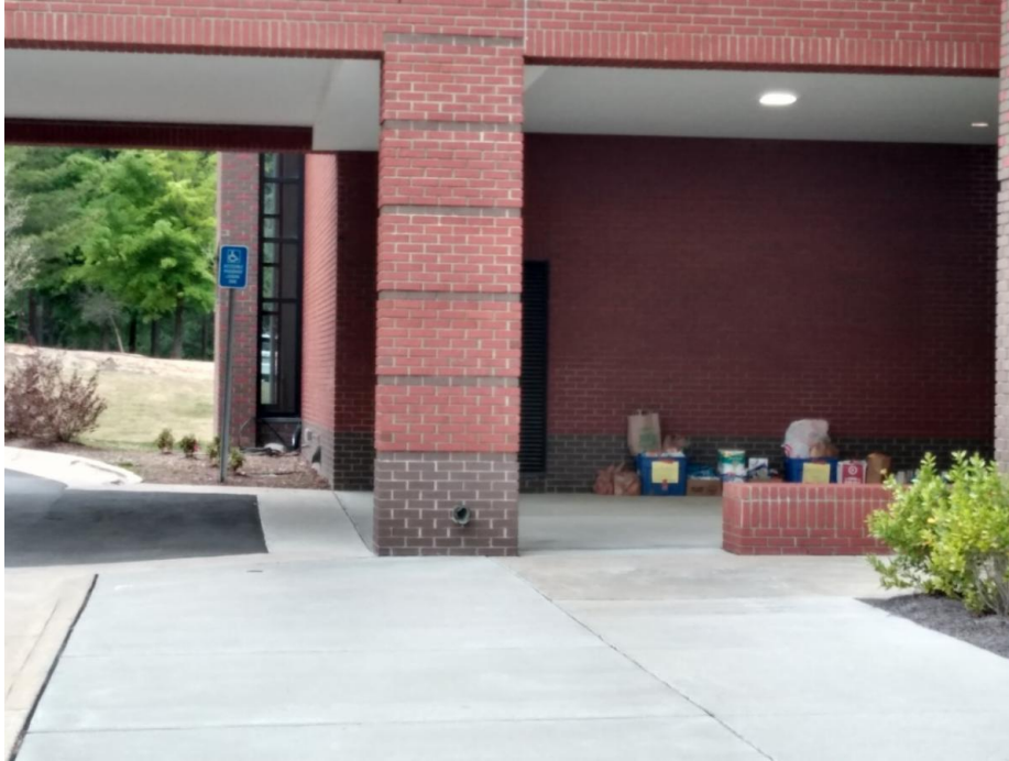
Collection Bins are located by the covered driveway at the Church