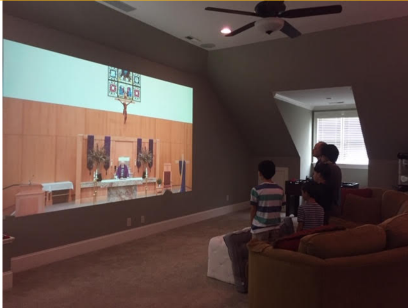
Bustos Family watching Mass Sunday