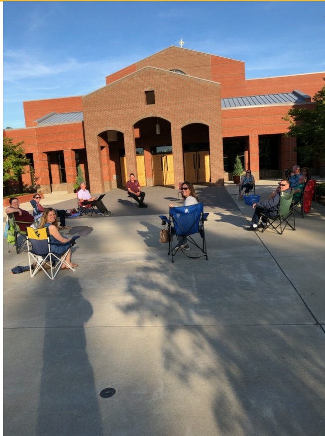
Covid outdoor Parish Council meeting