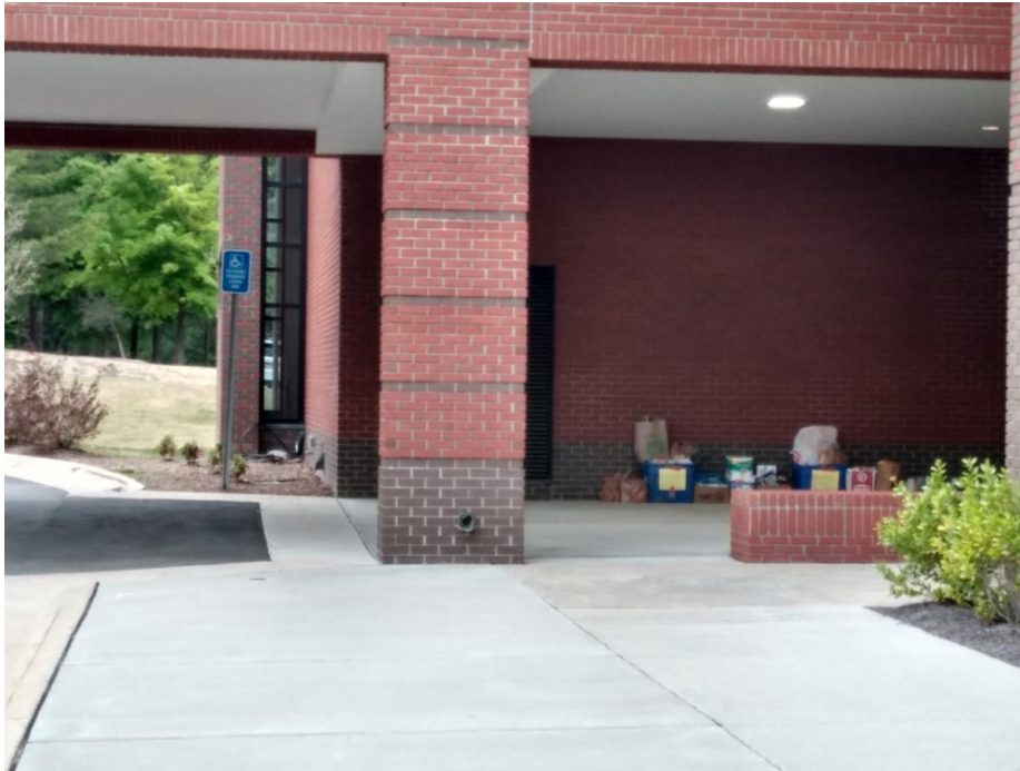
Collection Bins are located by the covered driveway at the Church