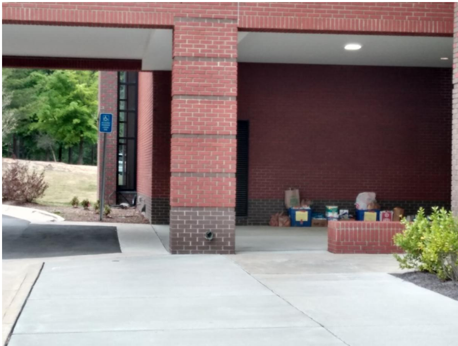
Collection Bins are located by the covered driveway at the Church