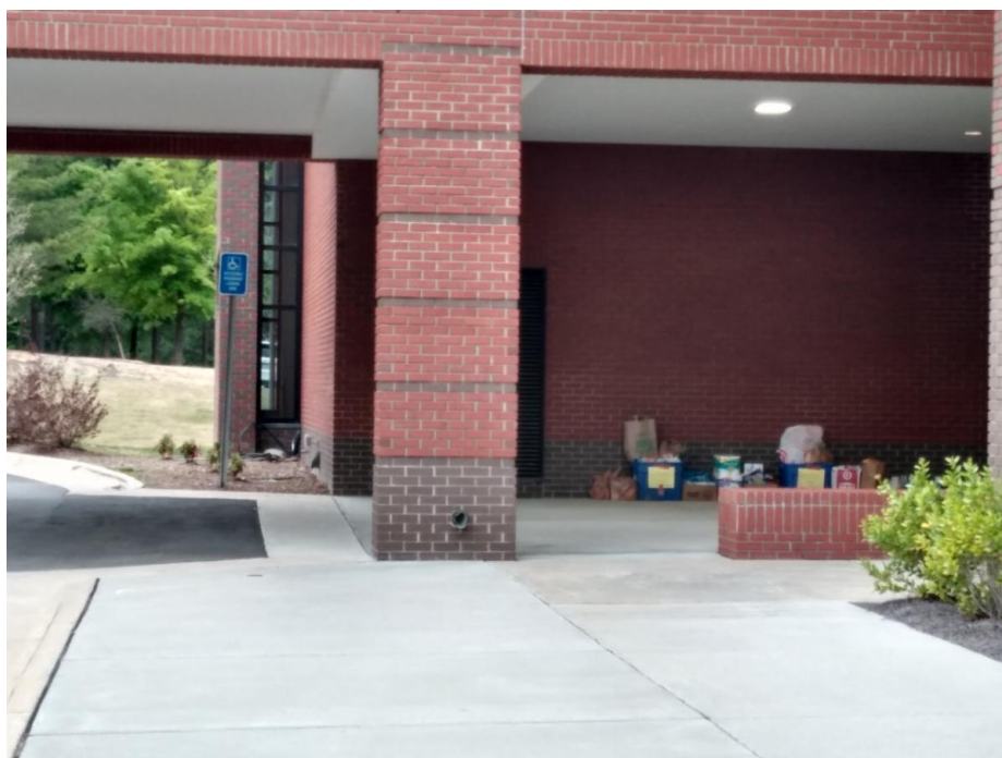
Collection Bins are located by the covered driveway at the Church