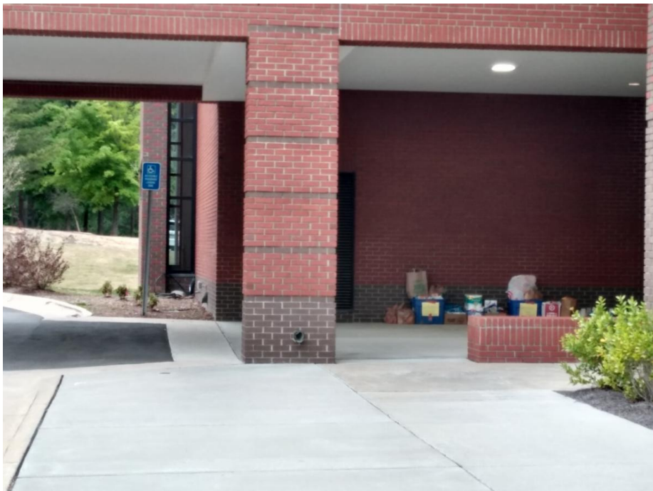
Collection Bins are located by the covered driveway at the Church