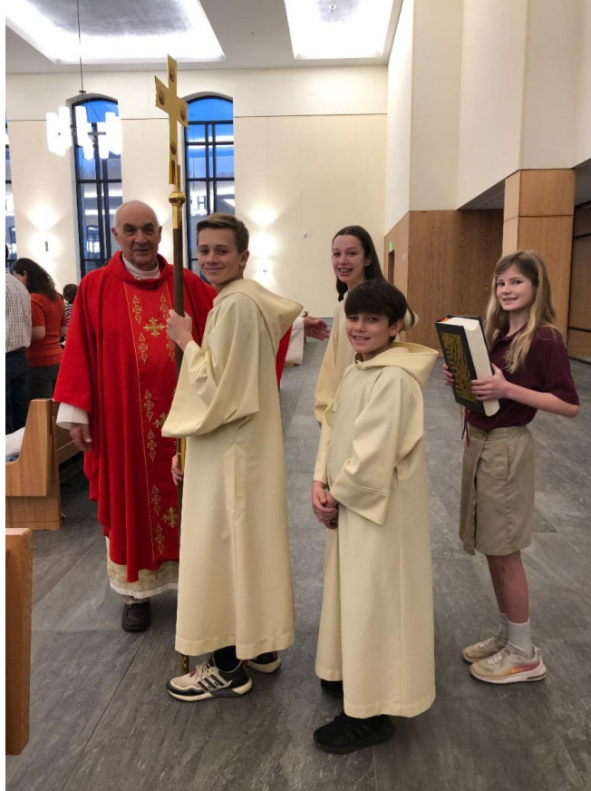
The start of School Mass on Thursday