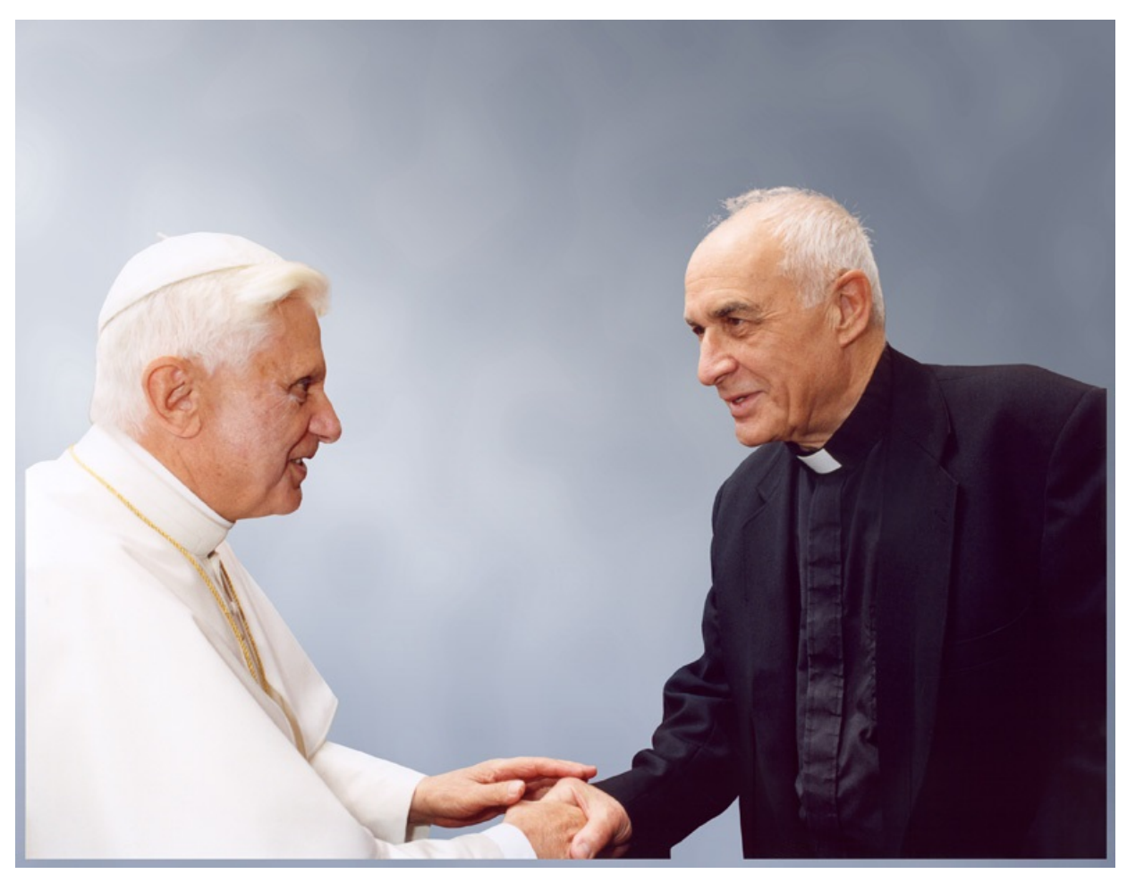
Pastor and Pope Benedict XVI in 2006