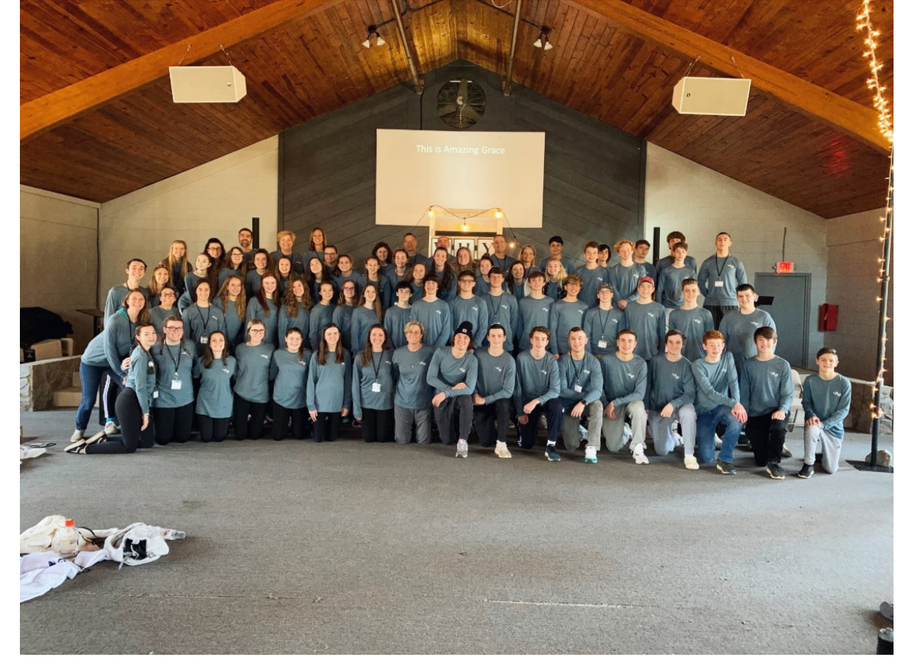
Winter High School Retreat