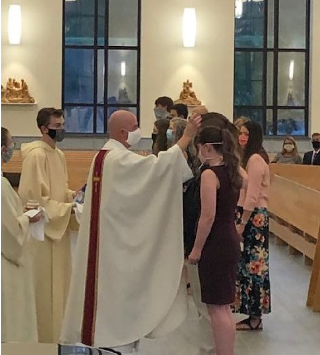
Confirmation Mass on August 6th.