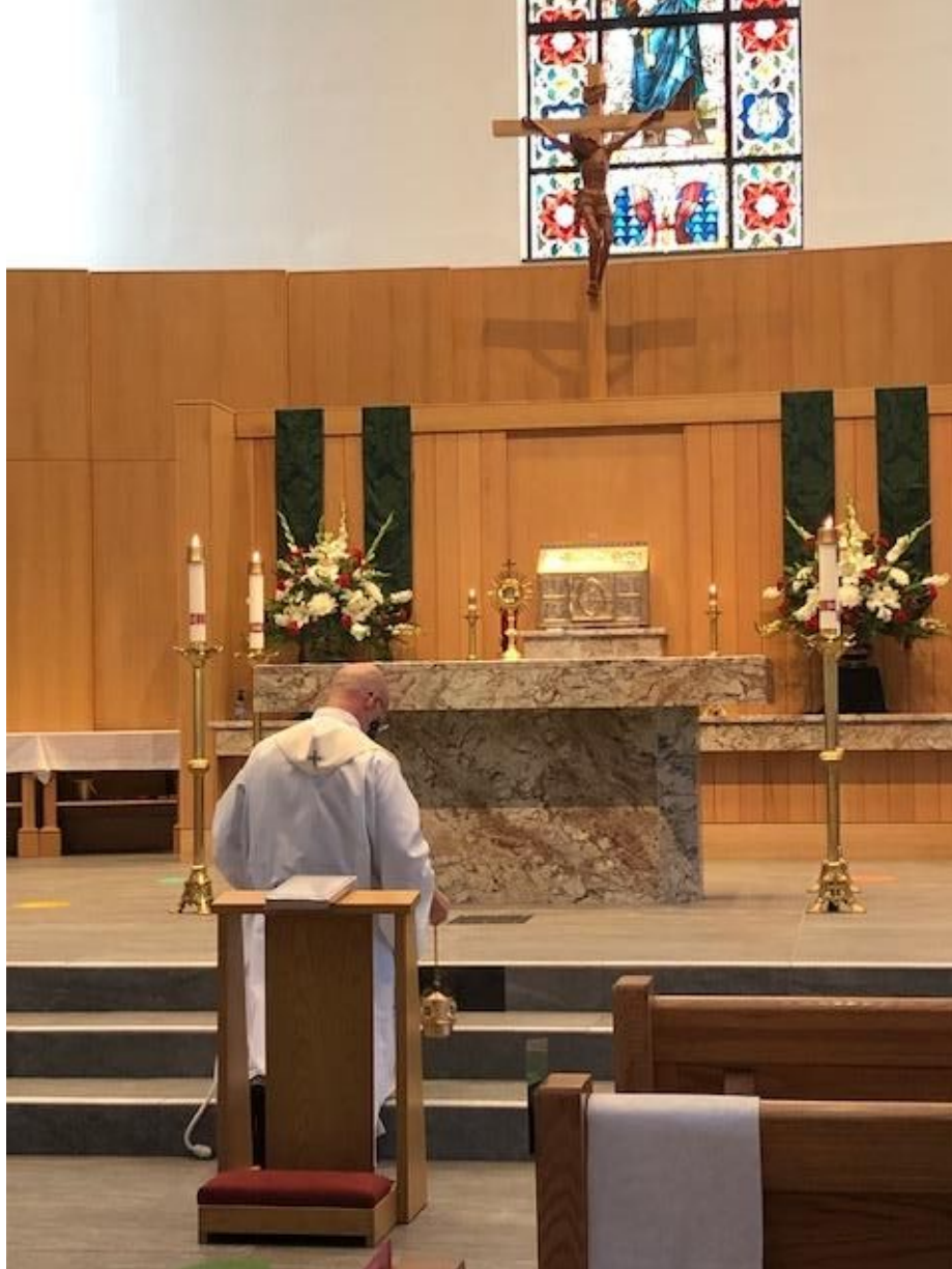
First Friday Adoration