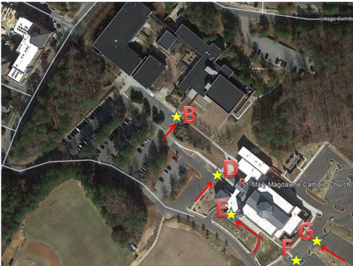
Stations for Communion