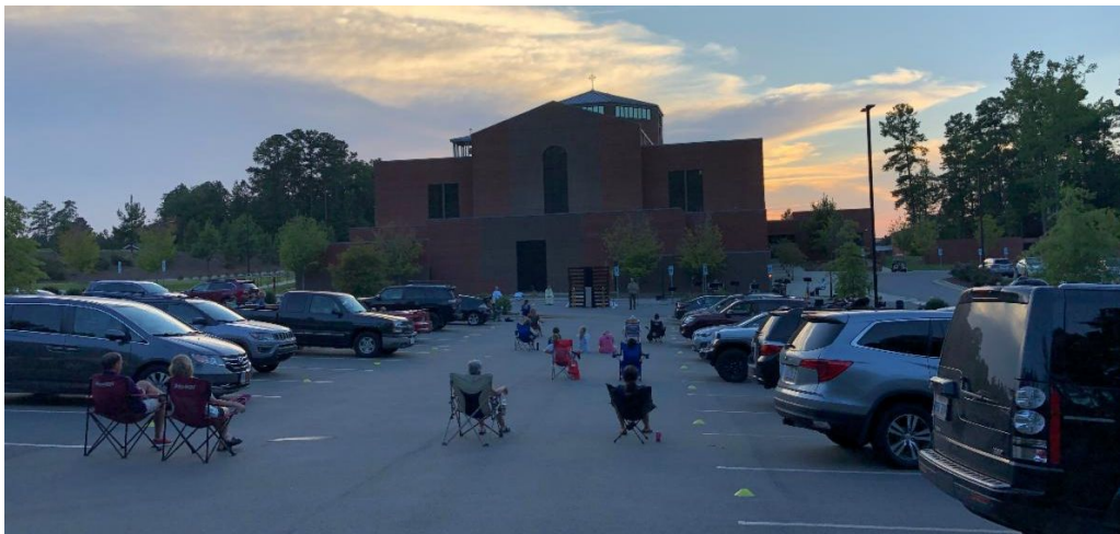
Youth Ministry had a XLT night on August 11th.