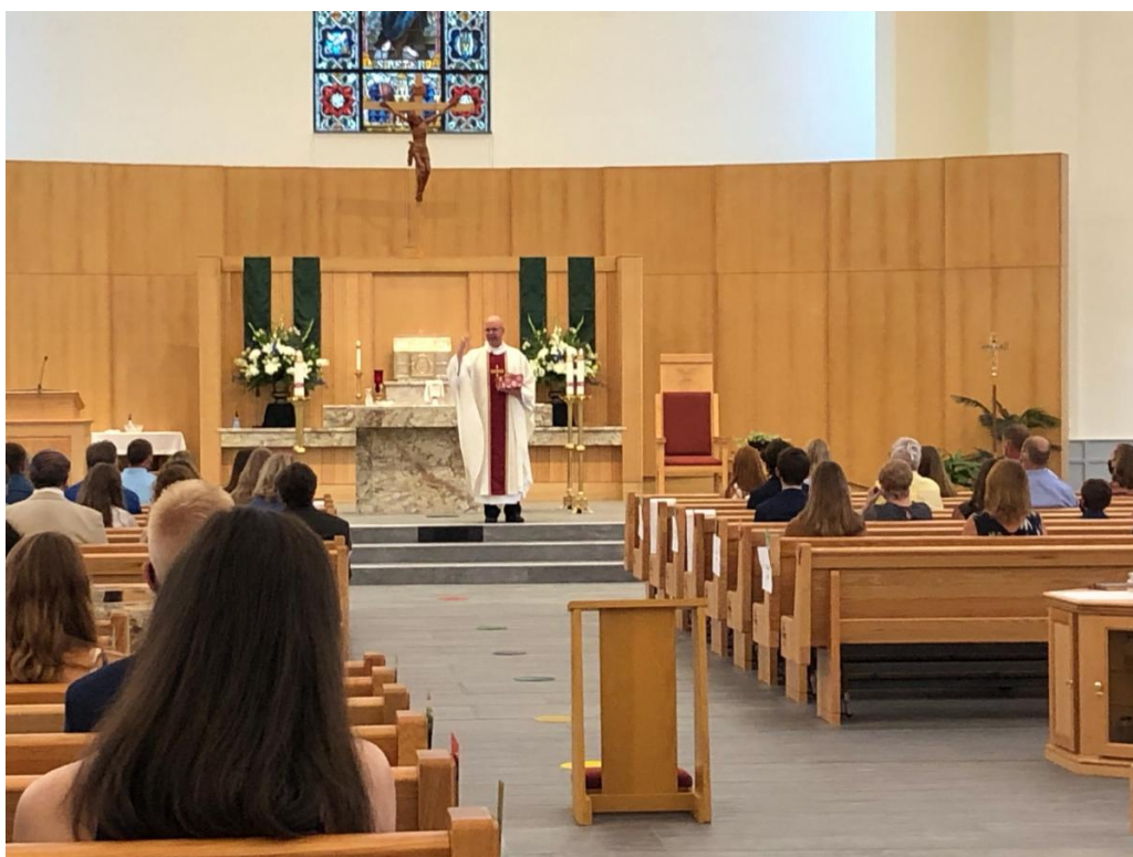
Confirmation Mass on August 13th.