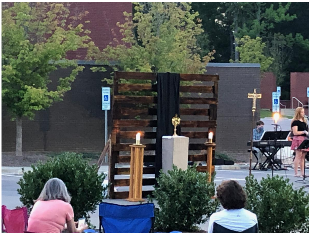
Youth Ministry had a XLT night on August 11th.