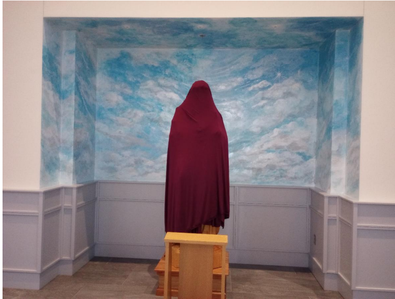
Check out the wonderful new murals at Church