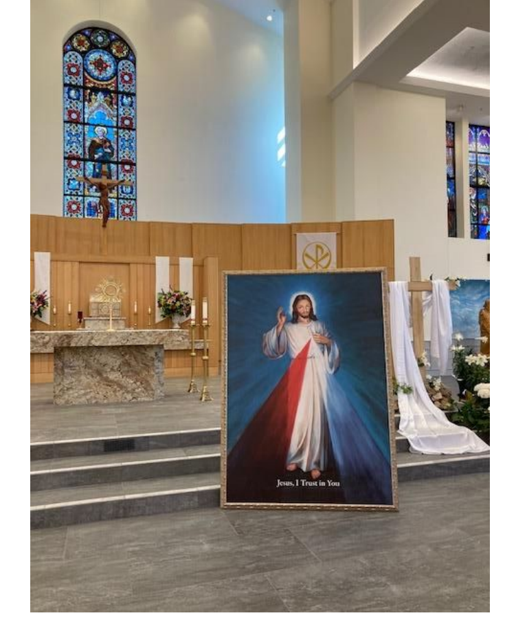
Divine Mercy Sunday celebrated April 24th