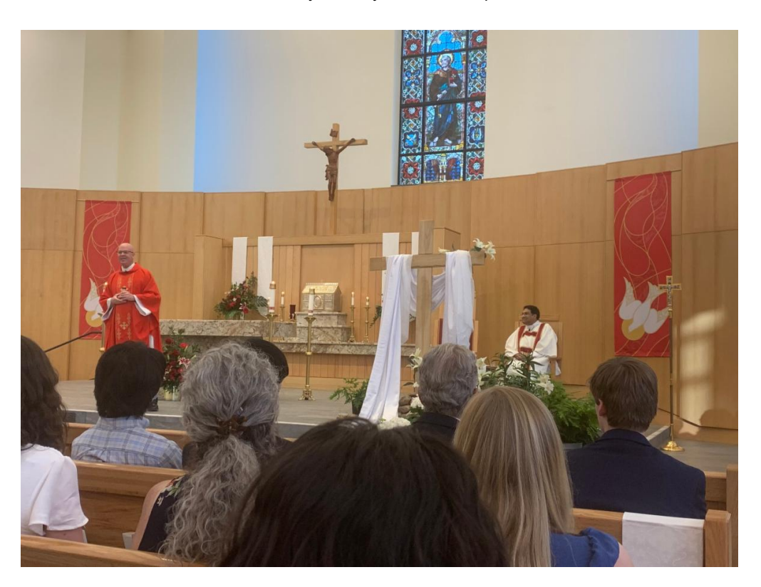
High School Confirmation Mass April 28th