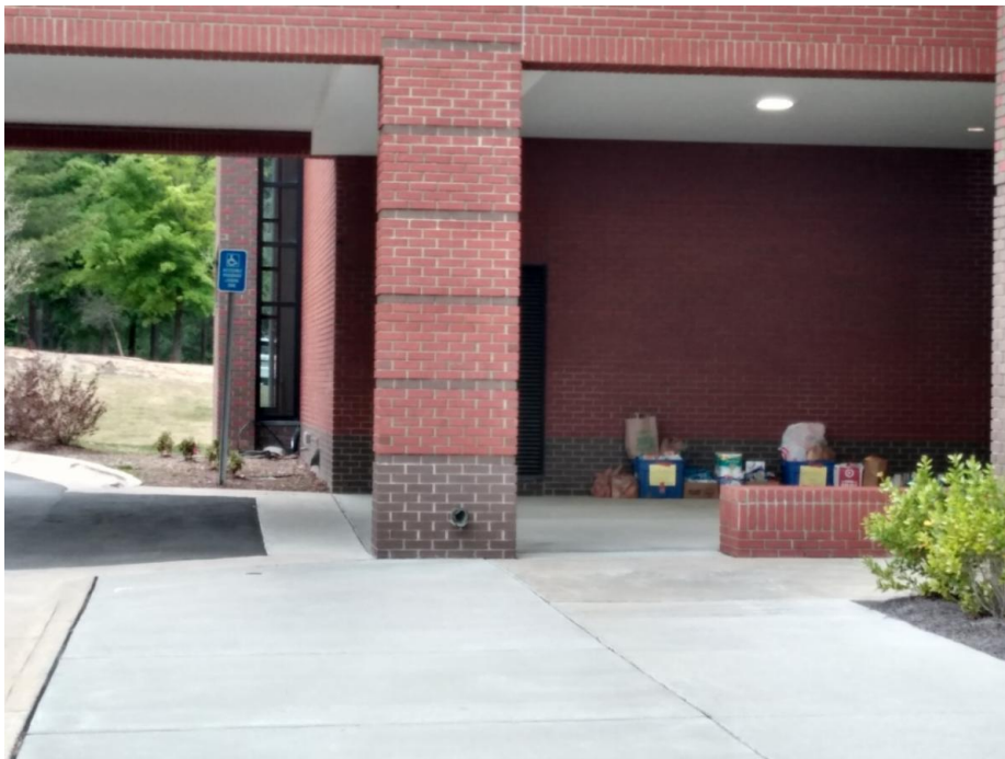
Collection Bins are located by the covered driveway at the Church