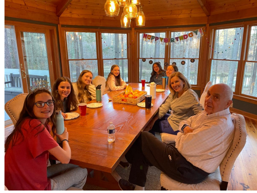
High School Girls' Retreat March 25-27