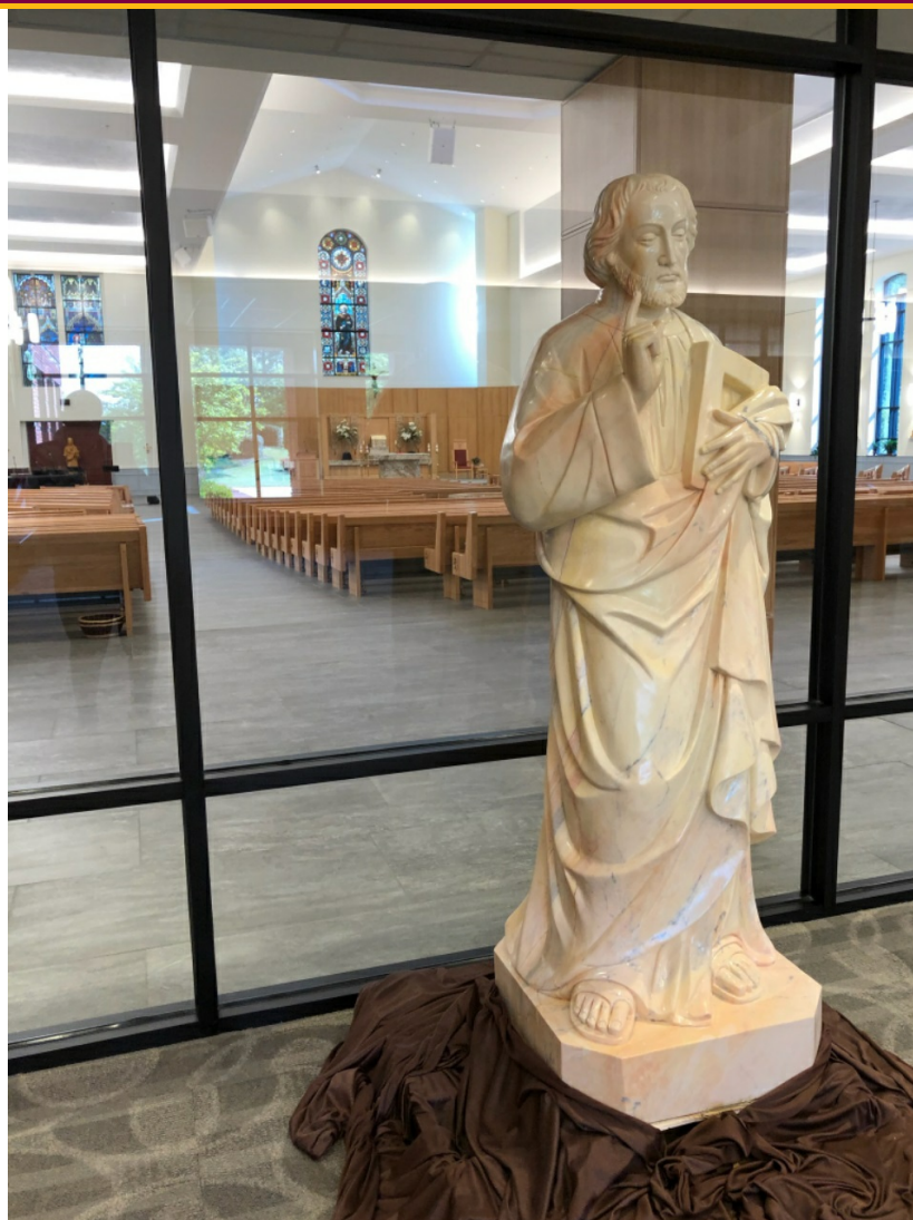
Our St. Thomas the Apostle