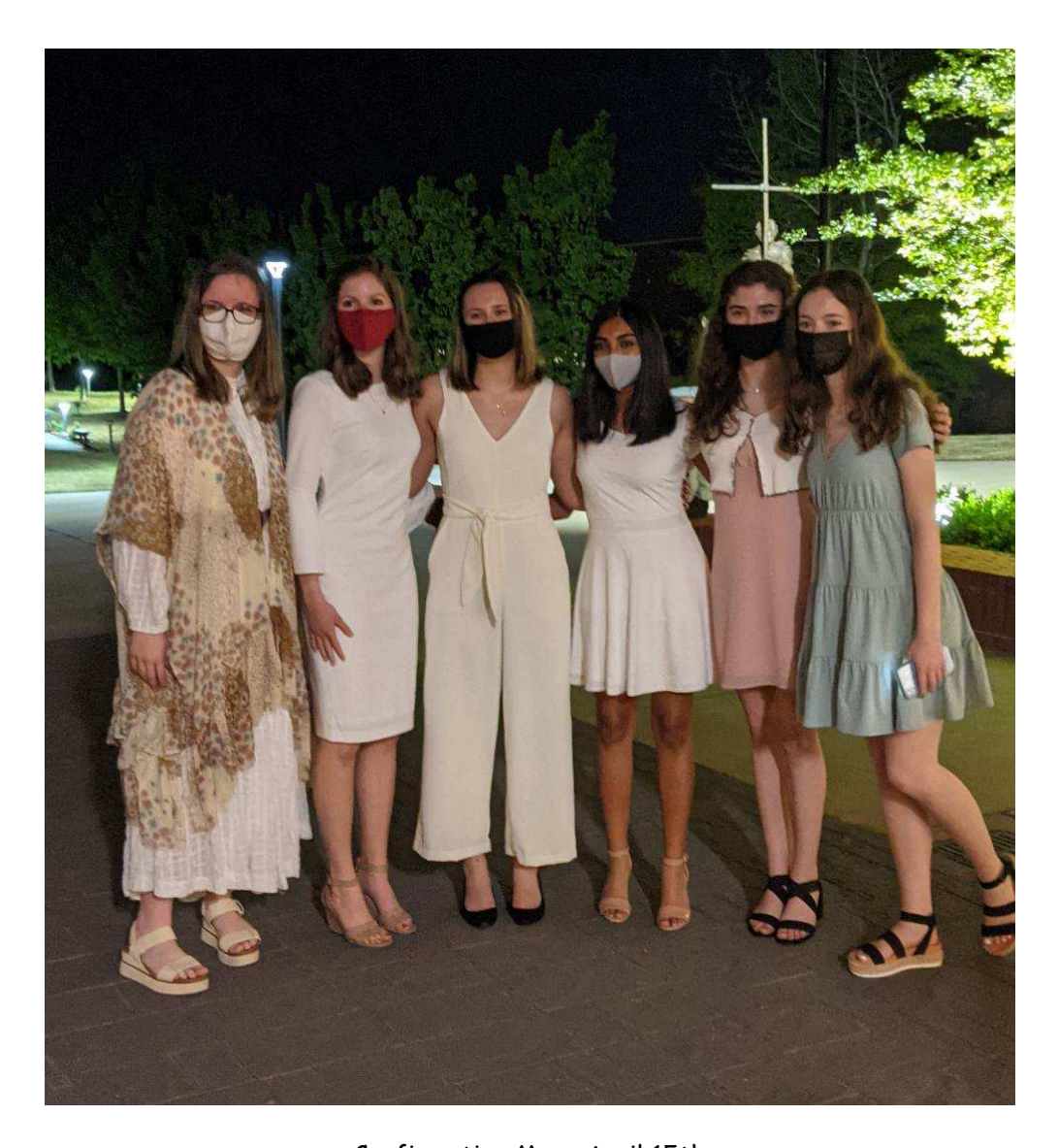
Confirmation Mass April 15th