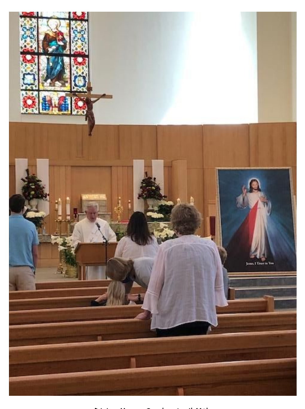
Divine Mercy Sunday April 11th