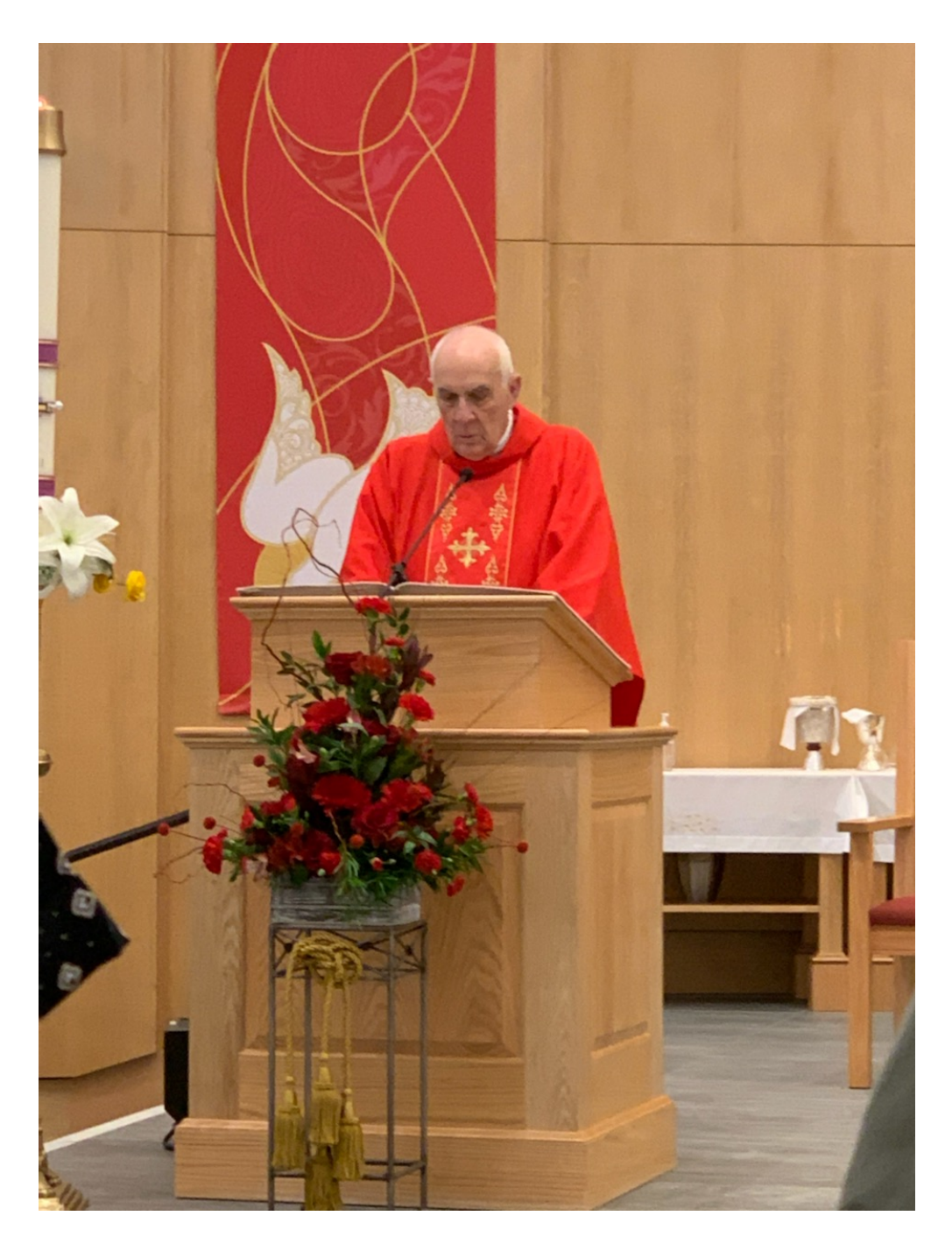
Confirmation Mass April 15th