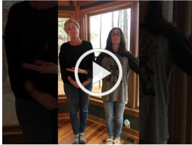
Help for Haiti