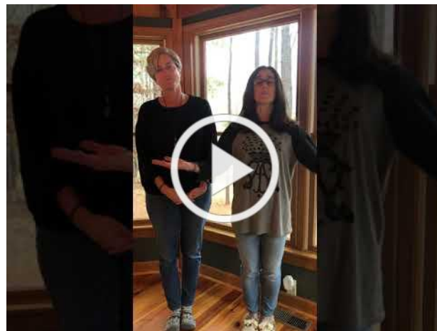
Help for Haiti