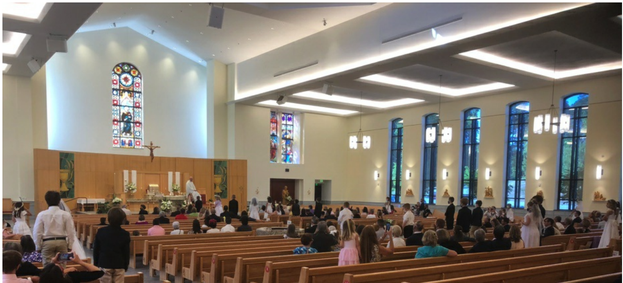
First Communion Mass on May 15th