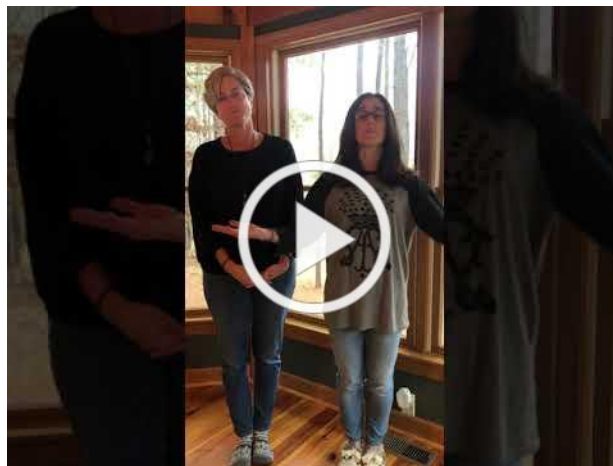
Help for Haiti